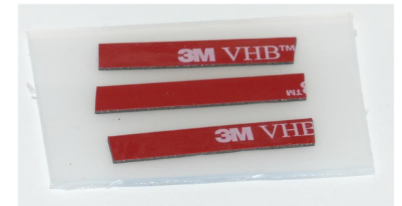
Tape to secure wires.

Power supplies are subject to substitution without notice due to availability issues and changes in regulations.