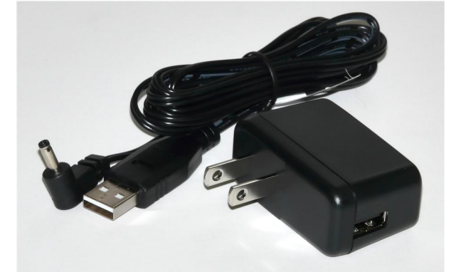
PN 10733 Power Supply - XP Power 5V 1A and PN 10734 Cable Assy 1.35mm ID x 3.5mm OD RA plug to USB A, 6 foot.

The illuminator may be powered by plugging the cable into the power supply provided, or into a suitable USB port on a computer or other device.